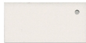
Plain Swing Ticket White, 70mm x 30mm Pack of 200 $7.50 (T3042WH)