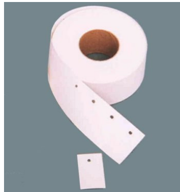
Plain Swing Ticket White, 25mm x 40mm Pack of 1000 $26.45 (CT-T74)