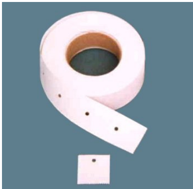
Plain Swing Ticket White, 25mm x 25mm Pack of 4000 $76.05 (CT-T34)