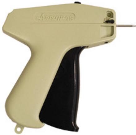
Needle Gun (inc 1 needle) General Purpose $32.80 each (T1913GY)