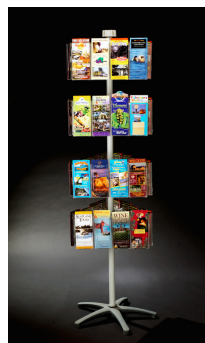
4-Tier Stand, incl.: 48x Trifold Pockets $463.80 (C48TF-4)