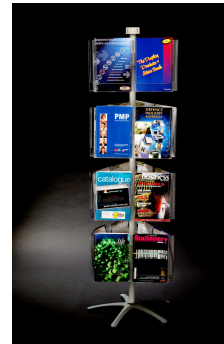
4-Tier Stand, incl.: 24x A4 Pockets $525.35 (C24A4-4)