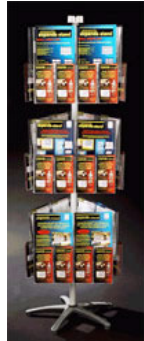
3-Tier Stand, incl.: 18xA4 & 36xTrifold Pockets $621.00 (C36TF18A4-3)