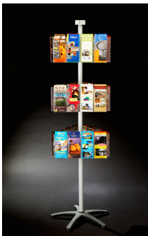
3-Tier Stand, incl.: 36x Trifold Pockets $379.55 (C36TF-3)