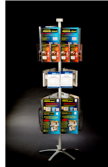
3-Tier Stand, incl.: 12xTrifold, 18xA4 & 6xA5 Pockets $543.10 (C12TF18A46A5-3)