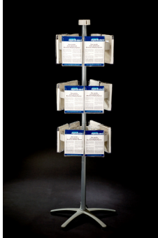
3-Tier Stand, incl.: 18xA5 Pockets $341.65 (C18A5-3)

Factory and showroom 167 Newcastle Street Fyshwick ACT 2609