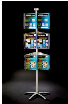
3-Tier Stand, incl.: 18x A4 Pockets $425.60 (C18A4-3)