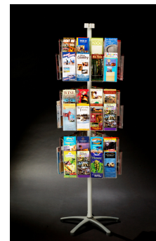
3-Tier Stand, incl.: 72x Trifold Pockets $574.85 (C72TF-3)